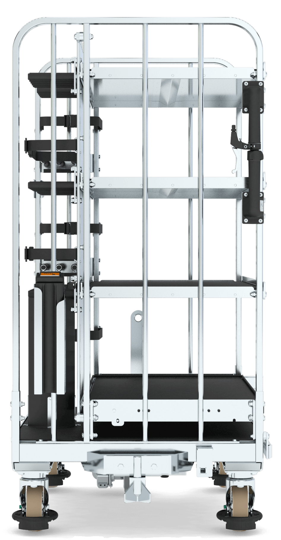
Products may differ from illustrations shown