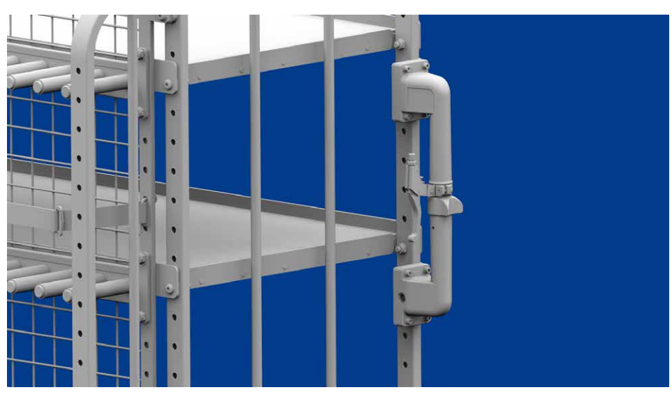
Due to the electricical aid of the kitting trolley, it can now be moved easily and flexibly with one-hand operation even outside the route train.