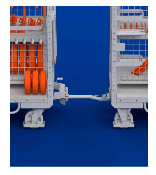
COUPLING AND DRAWBAR SYSTEM