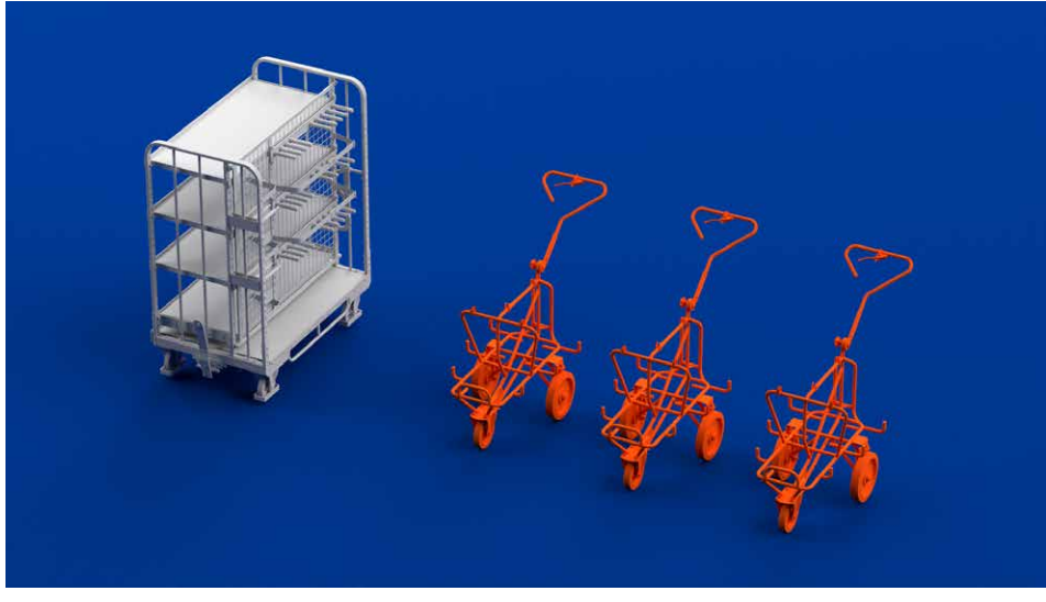
The kitting trolley offers the possibility of a mobile warehouse, which can be used to transport parts directly to assembly stations or other warehouses. In its structure, it is highly flexible and modular, adapting to the requirements of the load.